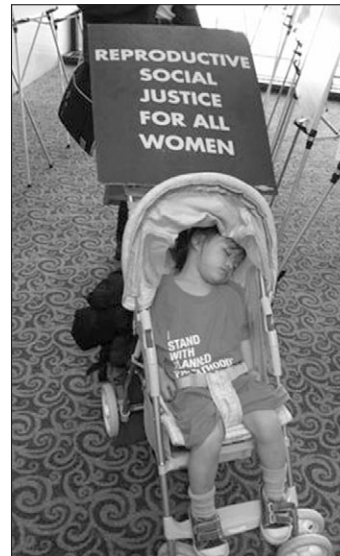
Thousands of people — young and old — descended upon Washington, D.C. on April 7 to stand up for women’s health and reproductive rights.

After spending the entire day standing for our belief in choice and standing for those who couldn’t make it down, we arrived back to the Garden State, exhausted but rewarded.