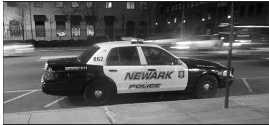
The ACLU-NJ documented 418 incidents of abuse by Newark Police in its petition to the Justice Department.

The ACLU-NJ cited 418 serious, routine civil rights violations reported by citizens in a two-and-a-half year period, including false arrests, inconsistent discipline of officers, discrimination and, most egregiously, acts of violence against citizens, some of which resulted in injury and death. The complaints included a 2006 case where a woman