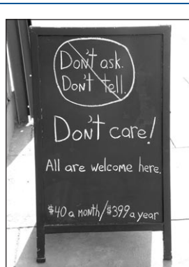
A Jersey City health club encourages guests to come as they are after the September decision overturning 'Don't Ask, Don't Tell.'