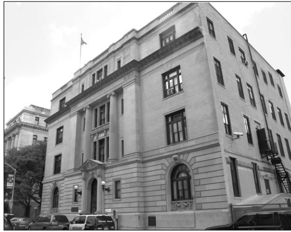
The headquarters of the Newark Police Department, which the ACLU-NJ has asked the U.S. Department of Justice to investigate after uncovering patterns of serious misconduct.

A swift reaction followed the report's release. Newark residents and officers began contacting the