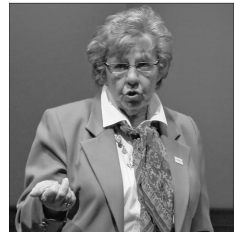
Sen. Loretta Weinberg (D-Bergen), pictured, championed legislation along with Assemblyman Joseph Cryan (D-Union) to lower fees for copies of government records, which Gov. Christie signed into law Sept. 10.

Residents across the state were facing similar obstacles, with some towns charging as high as $10 for the first three pages of public records. The ACLU-NJ and other advocates went to court to challenge individual towns' exorbitant copying fees, but it was clear statewide action was needed.