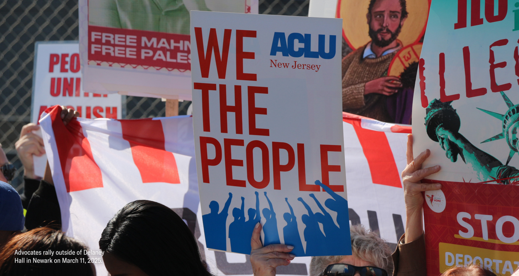
Advocates rally outside of Delaney Hall in Newark on March 11, 2025.