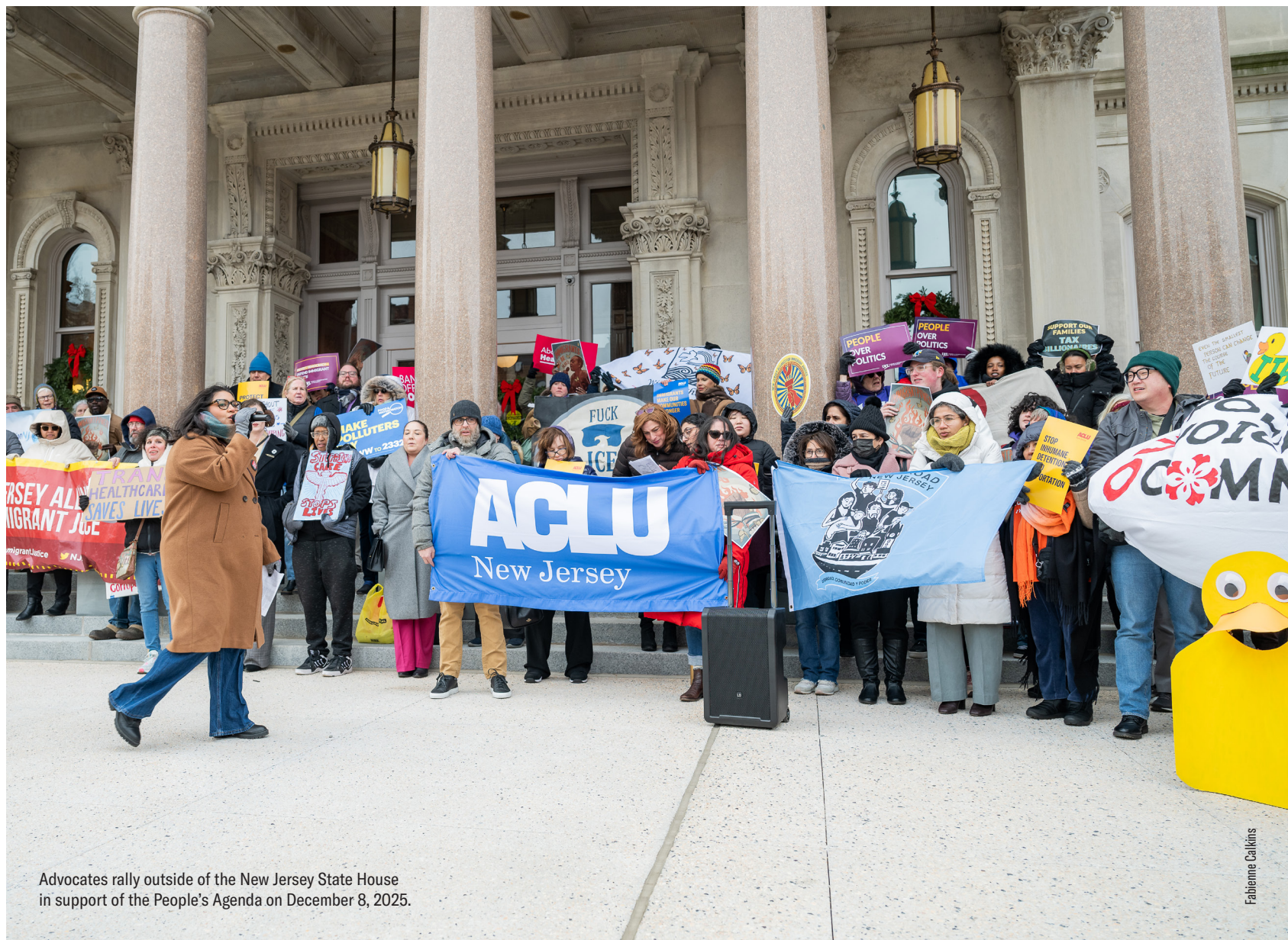
Advocates rally outside of the New Jersey State House in support of the People's Agenda on December 8, 2025.