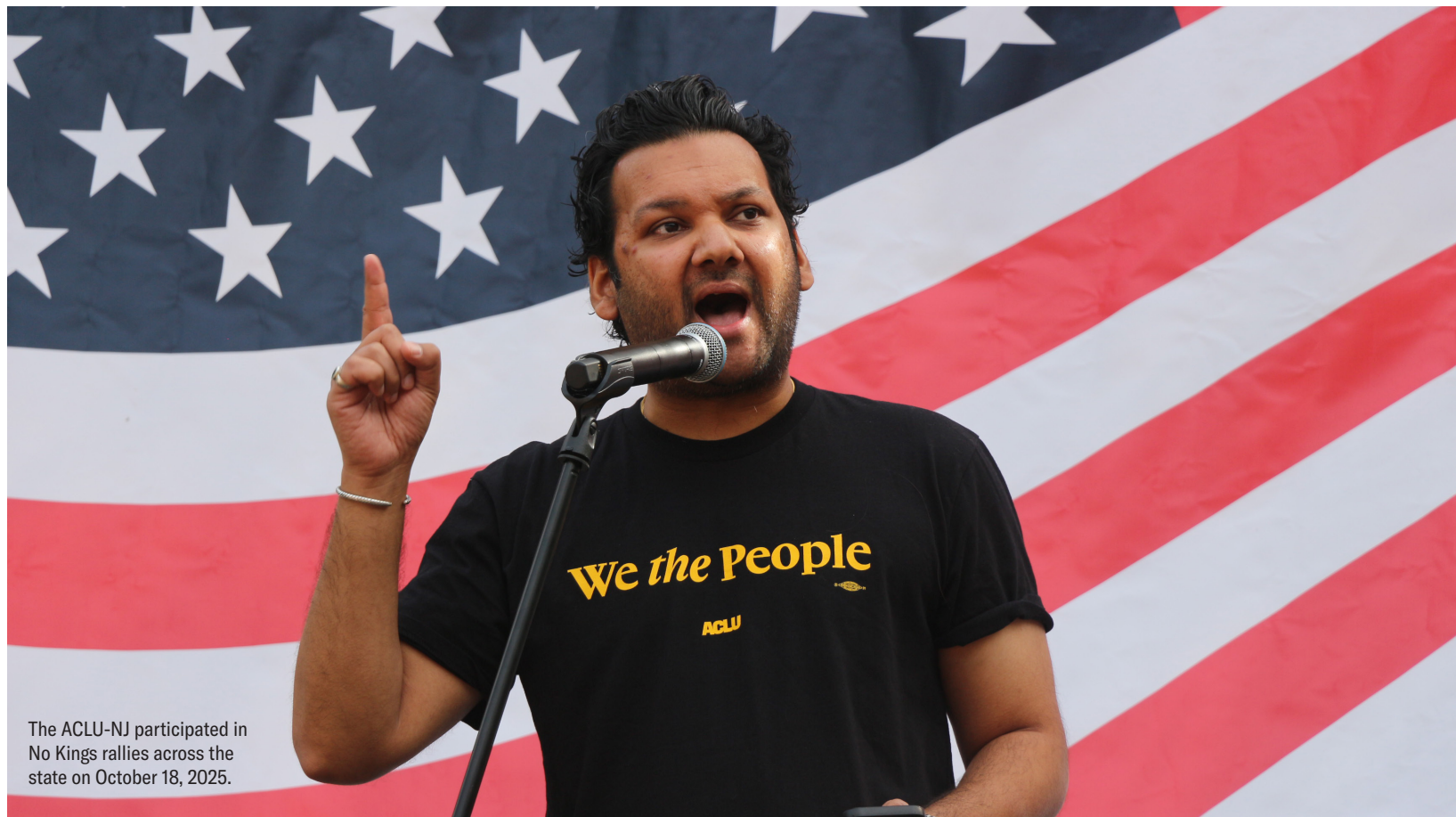
The ACLU-NJ participated in No Kings rallies across the state on October 18, 2025.