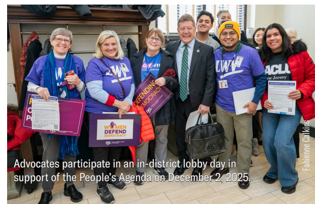
Advocates participate in an in-district lobby day in support of the People's Agenda on December 2, 2025.

As a result of this work, we celebrated the passage of multiple bills that will advance civil rights in New Jersey, including pieces of legislation that will strengthen protections against police use of force and advance immigrants' rights through the development of model policies for schools, hospitals, shelters, food pantries, and other essential services.